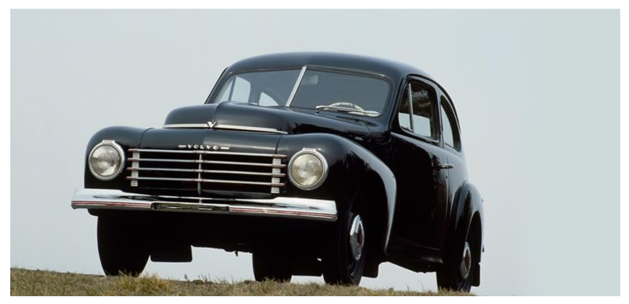
Or at least this vintage. But definitely this make.