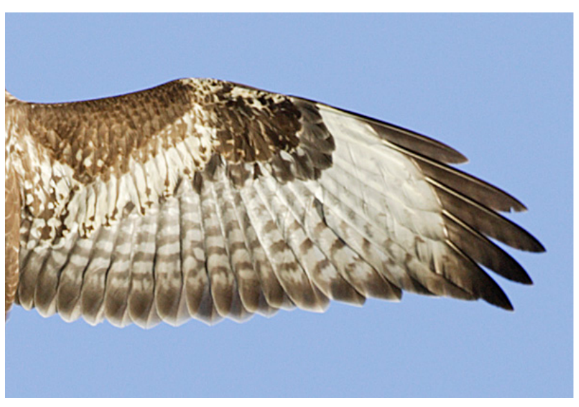
Miss P. has feathery appendages.