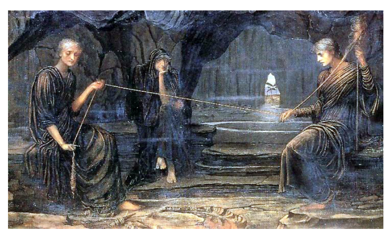
She's one of three sisters, the one on the right.