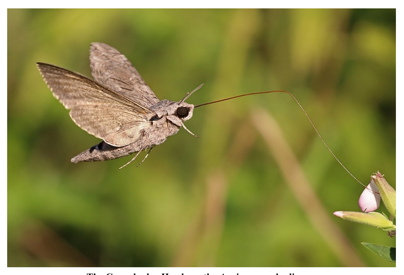
The Convolvulus Hawk-moth Agrius convolvuli