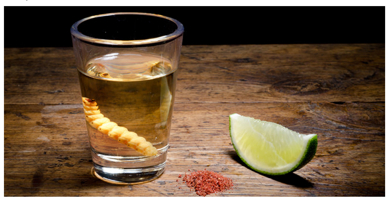
OK, that's the wrong caterpillar.